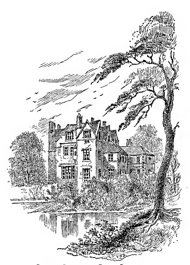
BREADSALL PRIORY, WHERE ERASMUS DARWIN DIED.